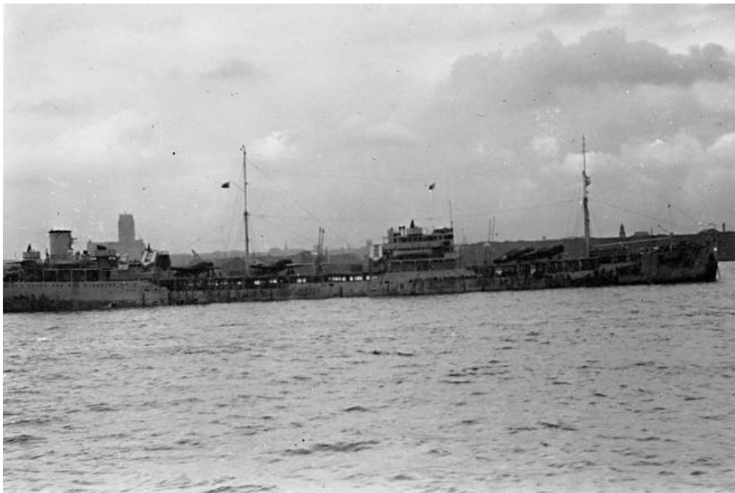
Image 3 is a postcard image showing Dolabella. Date and time not known

Image 2 shows Dolabella in the Mersey with aeroplanes destined for Russian loaded on her false deck.