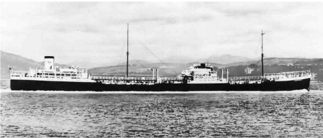
Image 1 is from an old postcard of Dolabella - the date is not known.

Dolabella was launched in 1939 and immediately put into service on WW2 convoys. Her war service was exceptional and she remained with the same company throughout her service life of 19 years until broken up in 1958. There is further information about some of her voyages on the Recollections section of the Benjido website HERE .